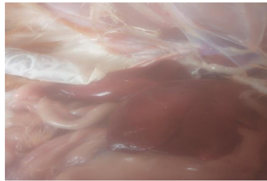
Figure II: Pneumonic and oedematous lungs

Colibacillosis, a syndrome caused by Escherichia coli ( E. coli ), is one of the most common infectious bacterial diseases of the layer industry. It causes significant economic losses (due to high mortality rates) worldwide (Regione and Woodward, 2002; Vegad and Katiyar, 2008). Colibacillosis has been reported to cause sporadic deaths both in layer and breeder flocks and has been noted to be the most common layer cause of mortality in commercial layer and breeder chickens (Nolan et al. , 2013).