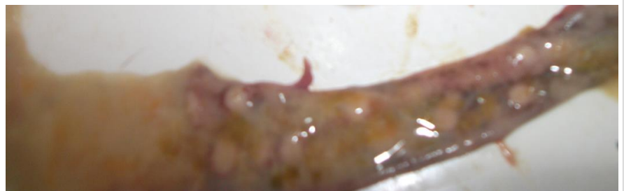
Figure.III: Mucoïd enteritis

Clinical signs observed in this present case such as drop in feed intake, watery greenish white faeces and persistent mortality is in agreement with those reported by Amit et al.