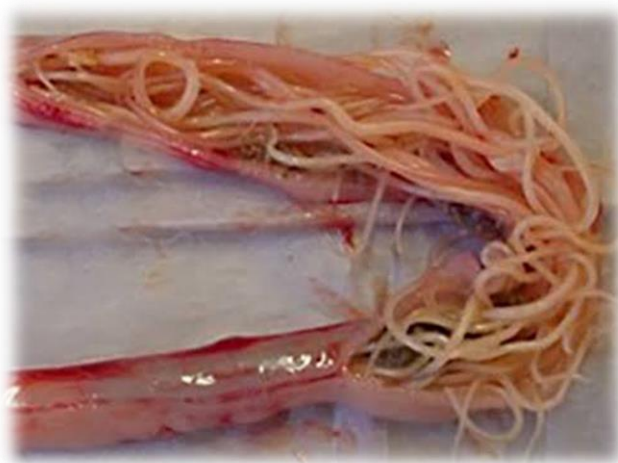
Figure IV: Duodenum opened; numerous adult A. galli causing partial obstruction