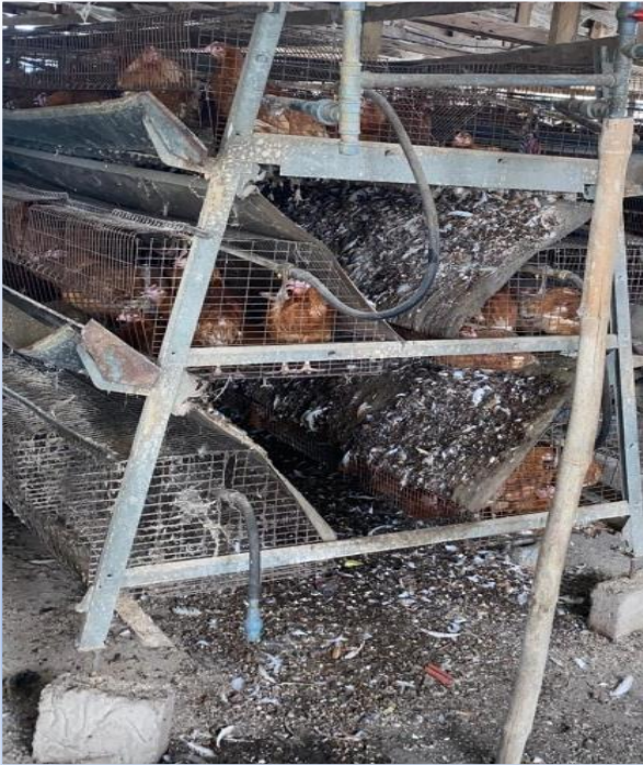
Figure I: A section of the birds in battery cage showing poor biosecurity, dirty dropping boards and floor and feather accumulation

Ascariasis can be controlled by regular anthelmintic treatment. However, frequent administration of anthelmintics can lead to their resistance (Salam, 2015). Since Ascaridia galli eggs require moisture for their survival, it is very important to keep the bedding dry and replacing it regularly with the fresh bedding in order to prevent the infection. All these preventive measures hold greater significance particularly to prevent the young birds from getting infected (Jacobs et al. , 2003). Previously, several researchers have documented findings associated with A. galli infection. These include the detection of nematode eggs in the faeces and the presence of large white worms in the poultry droppings of the bird. The primary treatment for Ascaridia galli includes anthelmintic drugs, mainly piperazine.