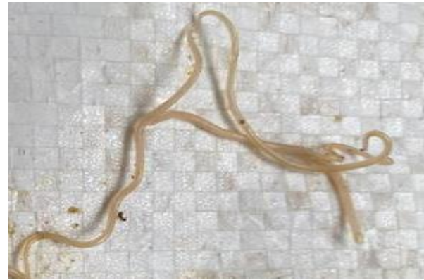
Figure V: Ascaridia galli